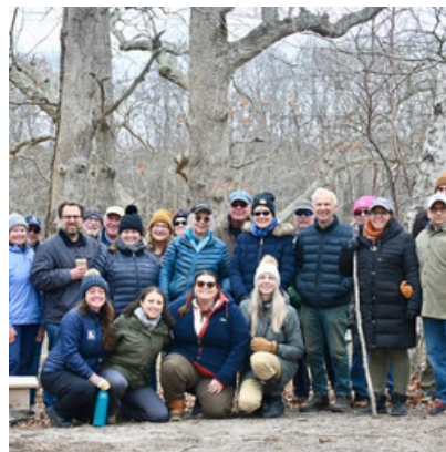
Winter Watershed Walks

Thank you to all of our partner organizations for working with us to protect and restore the Peconic Estuary. We truly could not do this work without your collaboration!