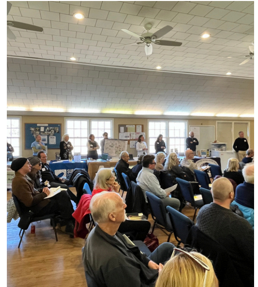
The Perfect Earth Project's Mini Grant funded workshop in March 2025