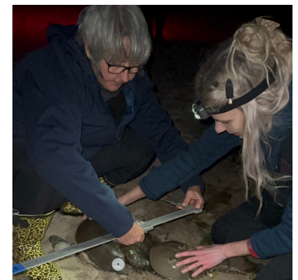
Horseshoe Crab Monitoring