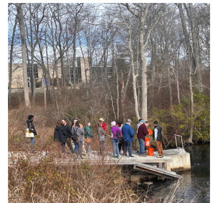
River Herring Training