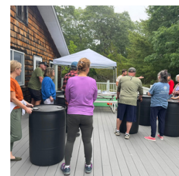
Rain Barrel Workshop