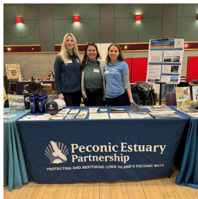
Natural History Conference