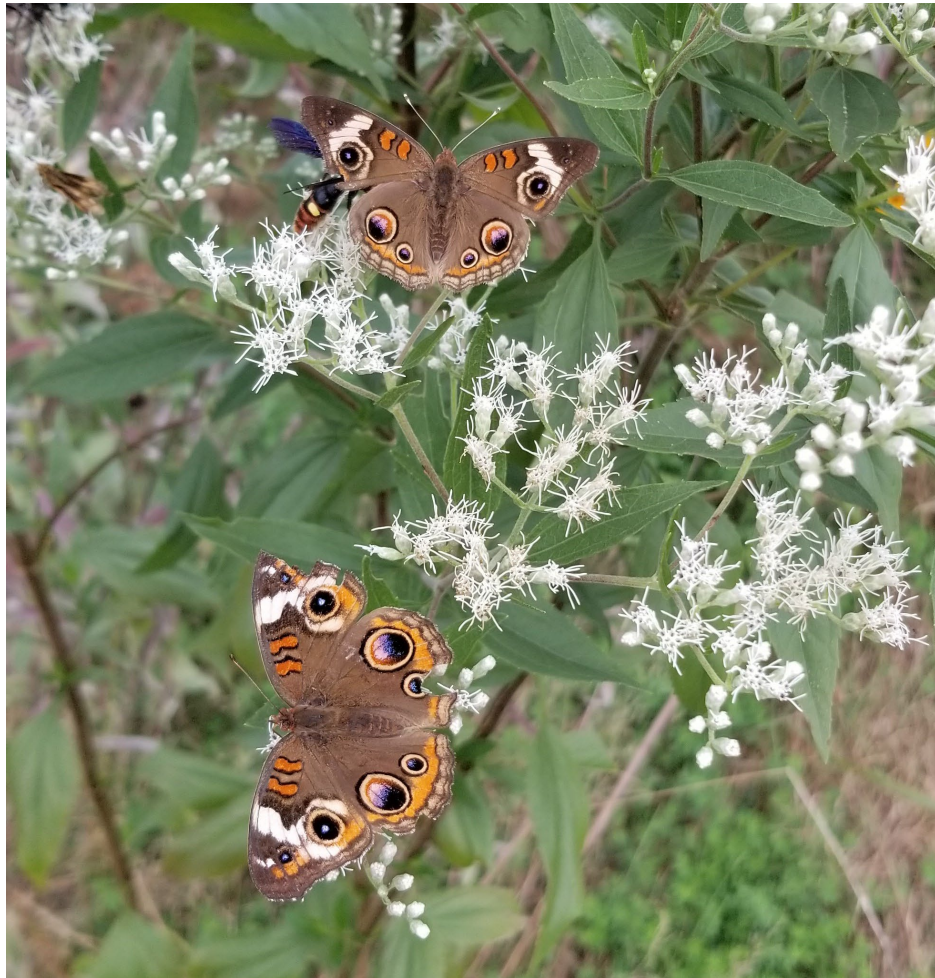
Eupatorium serotinum – Boneset or Late Thoroughwort with Junonia coenia – Common Buckeye Butterfly