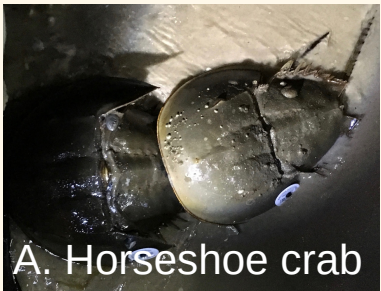
A. Horseshoe crab

All these animals live in the Peconic Estuary!