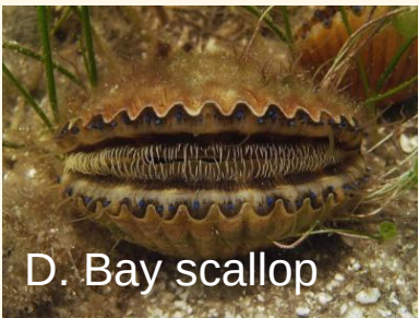
D. Bay scallop