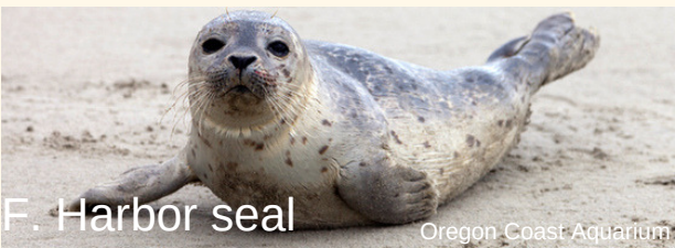
F. Harbor seal